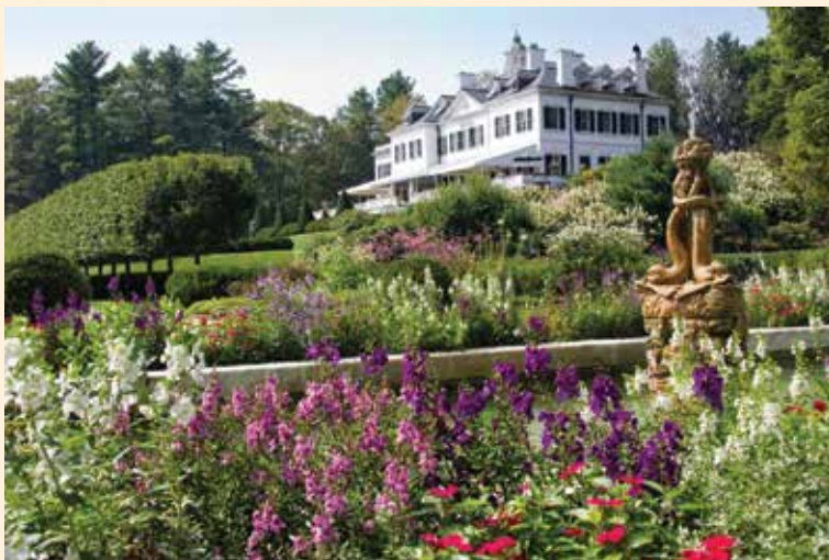
Edith Wharton's The Mount

Discounted tickets for OLLI members plus talkback. Order tickets directly from theatre.