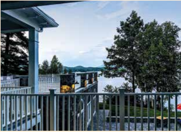
The Proprietor's Lodge, Pontoosuc Lake