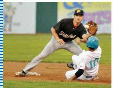
Wahconah Park, Pittsfield

THURSDAY, MAY 31, 10:30am ◆ Arts & culture in southern Vermont daytrip: the Laumeister Arts Center & the Bennington Museum.