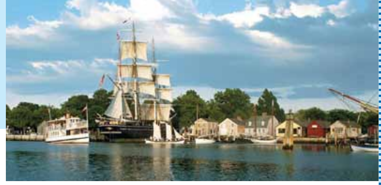
Mystic Seaport, Conn.

TUESDAY, JULY 10 ◆ Luxury bus daytrip to historic Mystic Seaport in Connecticut.