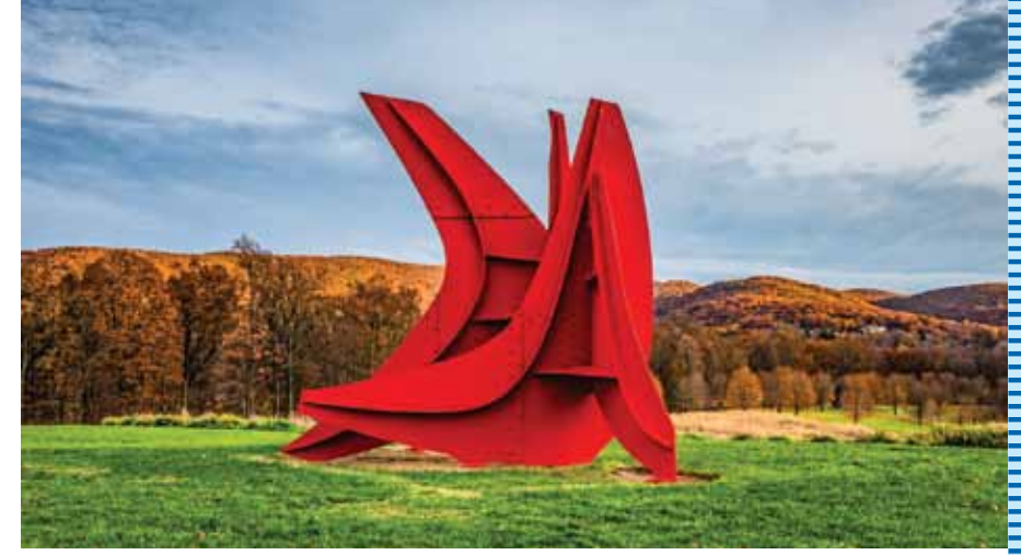
Alexander Calder's Five Swords at Storm King

& Company plus a talkback afterwards. Call the Shakespeare & Company's Box Office at 413-637-3353 and mention OLLI for a 40% discount on this performance.