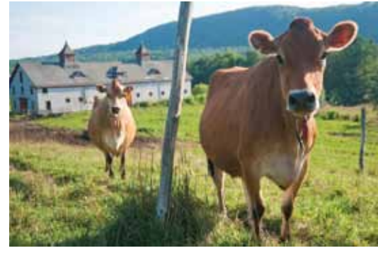
Highlawn Farm, Lenox

THURSDAY, JUNE 21 ◆ OLLI's annual evening at Jacob's Pillow in Becket featuring the Royal Danish Ballet, a lecture, and a picnic supper.