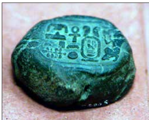
Ancient Writing Systems, page 9