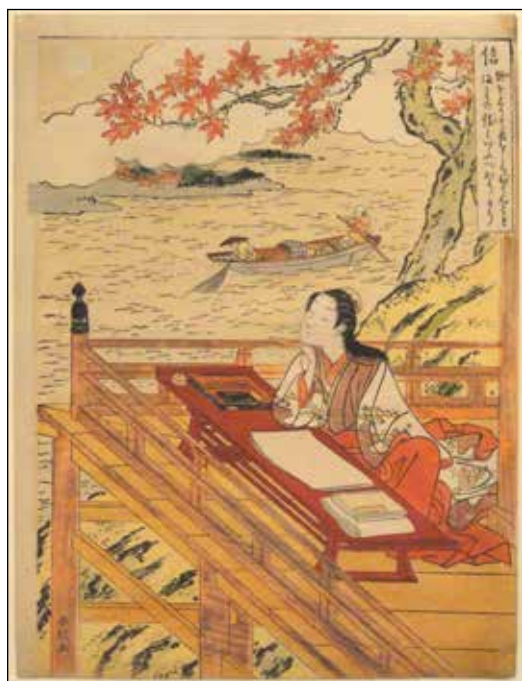
Murasaki Shikibu, author of Tales of Genji – Cracking the Medieval Glass Ceiling: Women Writers of the Middle Ages, page 7