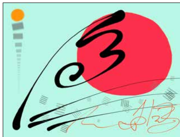
The Apples of Our "i": iPhone Photography and iPad Paintings, page 9