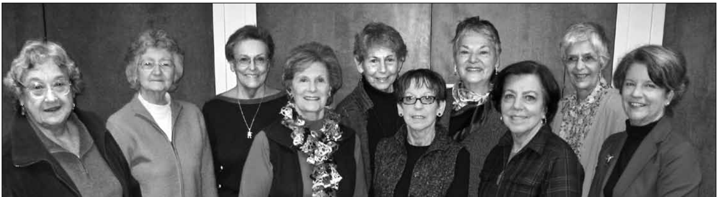
OLLI Newsletter Editorial Staff