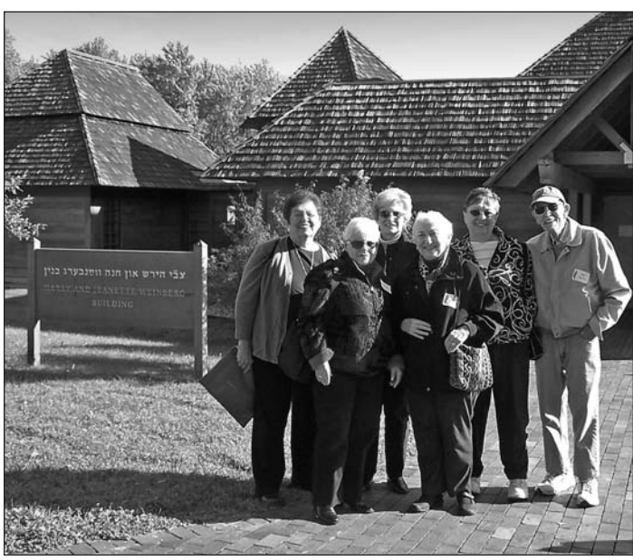
Special Events visit to the National Yiddish Book Center Northampton, October 2008