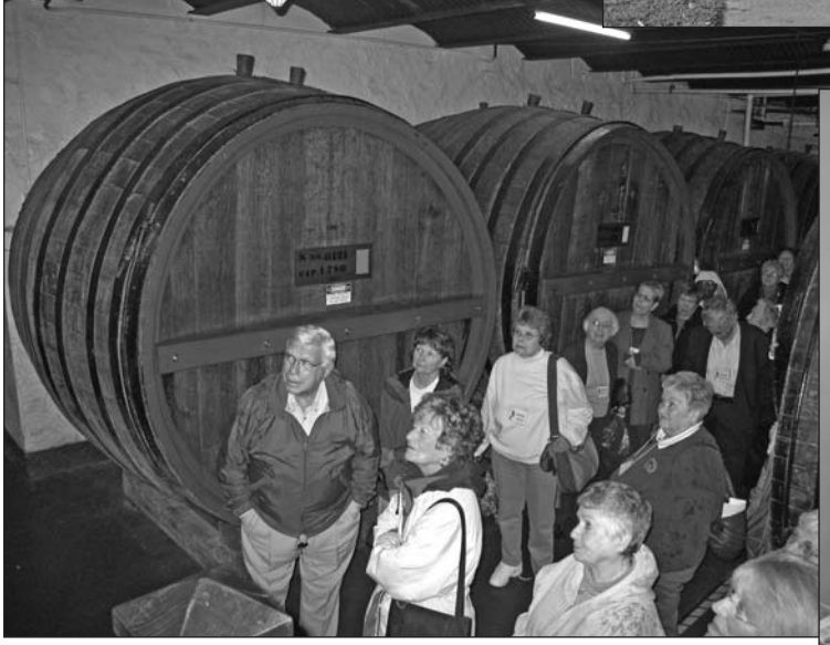
Above: Group in barrel room – Pleasant Valley Wine Company Right: Mastodon – Museum of the Earth