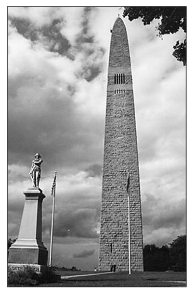
Battle of Bennington Monument

Information gathered from articles, papers and books in the Berkshire Athenaeum's Local History Department.