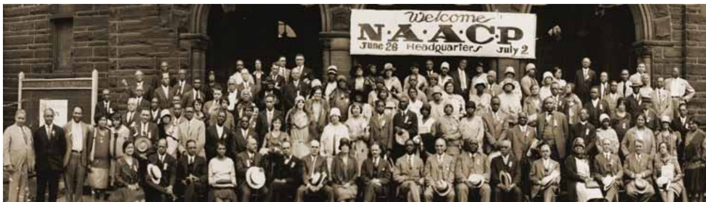
Du Bois was one of the founders of the NAACP. Here is a the 20th Anniversary session on June 6, 1929 in Cleveland, Ohio.