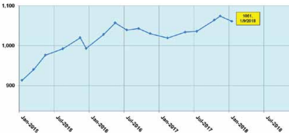
OLLI at BCC Membership Totals since 1/1/2015