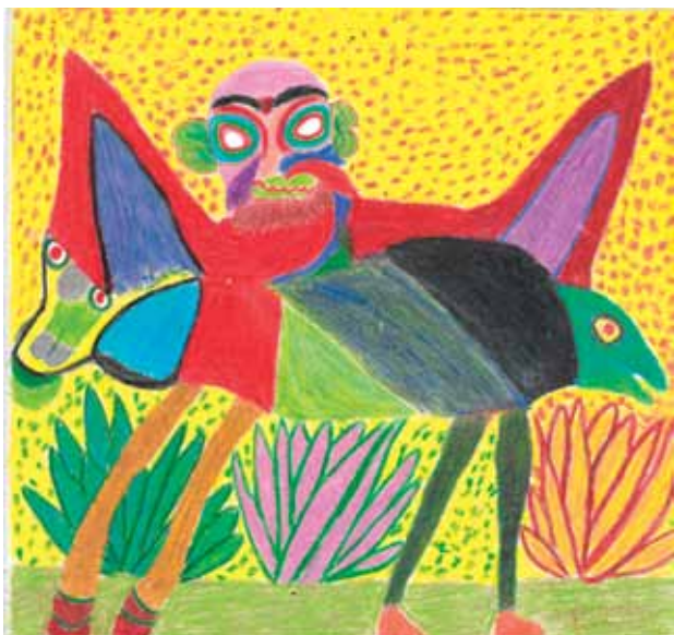
Prison art example from the collection of Phyllis Kornfeld, who will be speaking Sat., April 21.