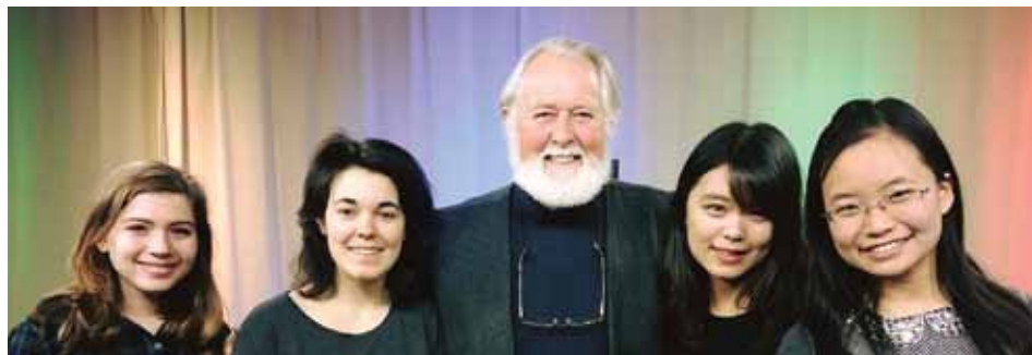
Miss Hall's School production interns with OLLI instructor and renowned baritone Benjamin Luxon, a Hello OLLI guest

"It's a whole lot of fun," she says. "As