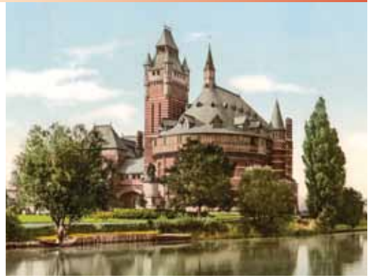
Shakespeare Memorial Theatre